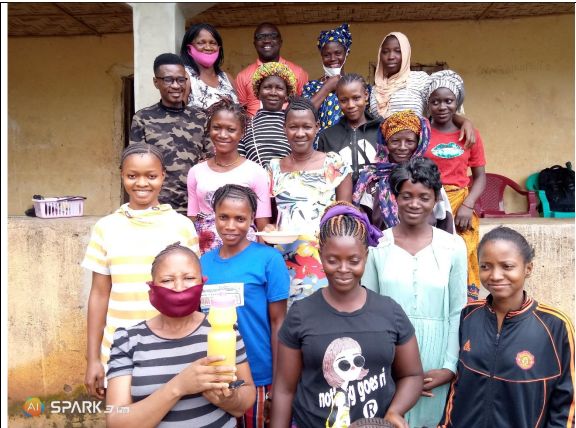
Juice producers in Kabala