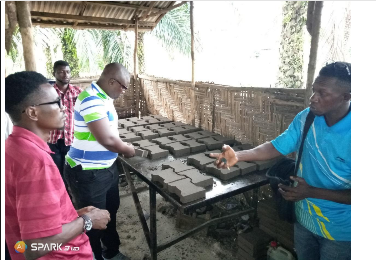
Plastic brick manufacturer in Makeni