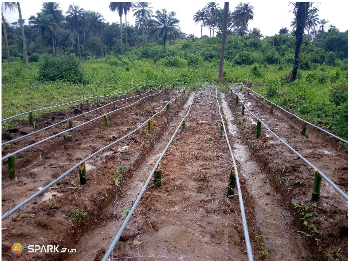
Auto-irrigation experiment in Kono – ongoing