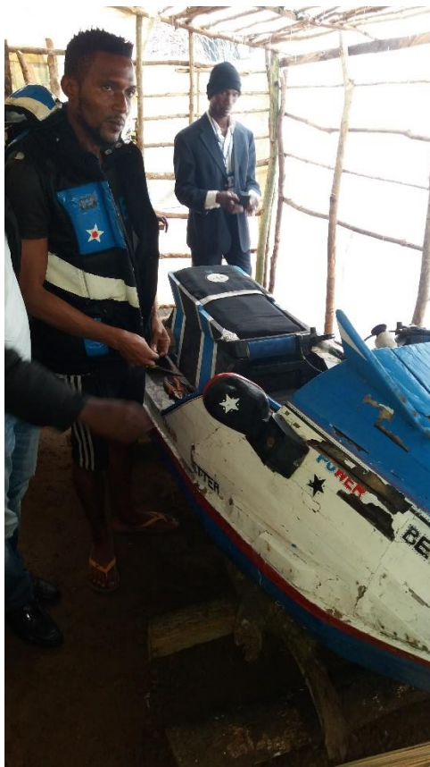
Local jet ski in Kambia