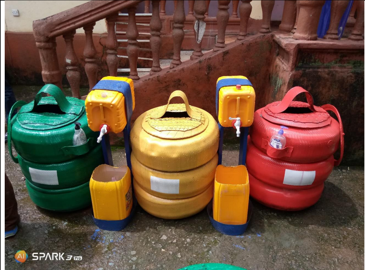
iBins (with hand washing station) in Makeni